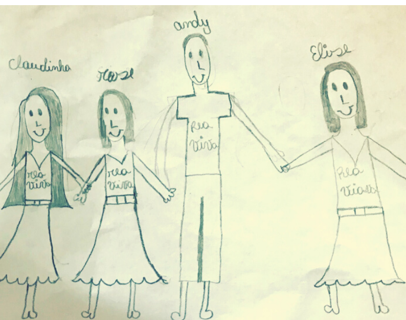
A child's perspective on some of the ReVive staff

"Our primary strategy is to engage with local community groups, churches and institutions to recruit foster families"